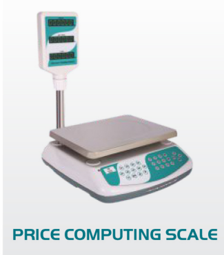
TABLE TOP SCALES